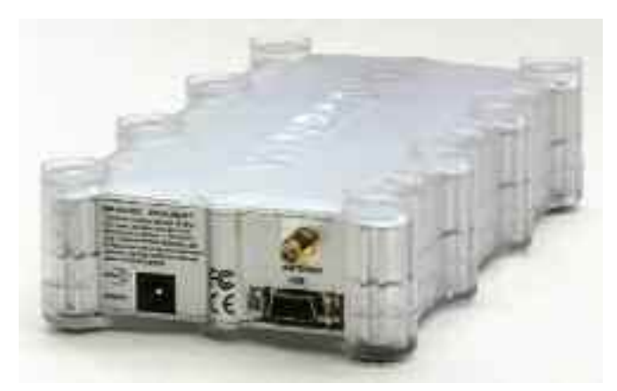
PHOTO 1: The Excalibur receiver hardware is contained in a small shielded box inside a clear plastic case.

INTRODUCTION. WiNRADiO have been developing and manufacturing PC controlled receivers and receiver systems since 1996. An Australian company supplying professional, government and hobby markets, they have an extensive product range and are one of the leaders in software defined receivers. Their latest model is the WR-G31DDC Excalibur, a direct digital sampling receiver for use up to 50MHz. Boasting a high performance specification, I was keen to check it out to see how well it performed.