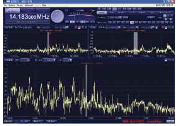
PHOTO 3: The control panel continuously displays three spectrum scans.

ON THE AIR PERFORMANCE. I liked very much the user interface, a good balance between ease of use and well presented information. The various spectrum displays were excellent and give a good visual impression of the radio environment. The main design focus of the radio appears to be AM broadcast for which it is excellent. Tuning with step sizes other than 1kHz, such as 10Hz or 100Hz on SSB, is a two